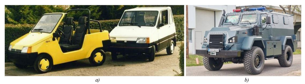
Figure 1. The Hungarian Puli small car (a) and Komondor military vehicle (b)

Before we examine the listed groups in more detail, it is worth considering the Hungarian aspects of the topic as well. Our country never achieved a world market role in the field of self-developed and mass-produced passenger car production, but we achieved outstanding economic results in the segment of truck and bus production, where the most important players in the domestic industry were Ganz, Rába and Ikarus.