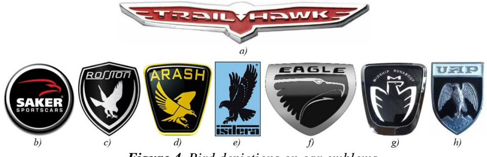
Figure 4. Bird depictions on car emblems

The old logo of New Zealand's Saker Sports Cars company depicted the falcon still in falling flight, which was more of an expression of speed, but the current dynamically lined hawkhead ( Figure 4b ) is also distinctly streamlined effect. The image of a hunting falcon hitting a prey on the American Rossion and the British Arash supersport cars sends a message of the aggressive appearance conveyed in the design of their vehicles ( Figure 4c-d ). The logo of the custom-built sports cars of the German company Isdera (Ingenieurbüro für Styling, Design und Racing) shows an eagle in a light blue field, similarly while hunting ( Figure 4e ).