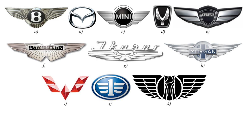
Figure 3. Using wing motif on car emblems

Figures 3f–h show the logos of two British car manufacturers. The legendary and successful Aston Martin has wings on its logo in the same way as Morgan, which builds unique old-style cars that use modern technical solutions within. In the middle, Figure 3g shows the old logo of the Hungarian Ikarus buses, with a wing motif at the bottom, which evokes the eponymous Ikarus, since according to Greek mythology he was the first person to fly. He embodied an openness to novelty, a desire for human ambition, overcoming fear, and the idea that human ingenuity can work wonders. But at the same time, Icarus has also become synonymous with rebellion, wordlessness and curiosity, qualities that often drive an innovative manufacturer forward.