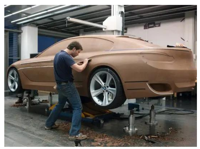
Figure 3. Creating a car body clay model [F3]

Study models or mock-ups serve the purpose of carrying out various tests and measurements on them. Figure 3 shows the creation of a car body clay model. It is apparently a detailed work, but with its help designers can collect a lot of important information about the 1:1 scale model of the dreamed form. The importance of the procedure developed by GM chief engineer Harley Earl is so much unquestionable as it is still used today. For example, on a 1:1 sized clay model of a car body we can make aerodynamical experiments in a wind tunnel. From this point of view, we are now talking about the clay model as a mock-up.