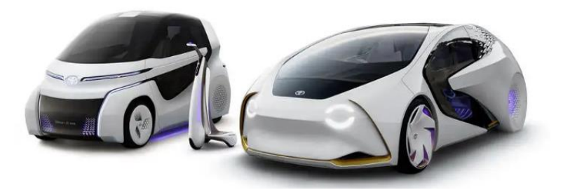
Figure 5. Toyota Concept-i series [F5]

Working models allow designers to examine certain parts of the design in action. In terms of cars, concept cars are of great importance. These are the models that are exhibited at various car showrooms, and those that can be taken for a test drive by interested possible customers, or which the main character of a movie races with on a cinema screen. These are the models with which car manufacturers can test the reactions of potential users or on which they can test certain experimental technologies. Figure 4 shows the Renault Morphose concept car. With the help of the QR code that can be seen in the figure a video introduces the concept can be watched. Figure 5 shows the Toyota Concept-i series concept.