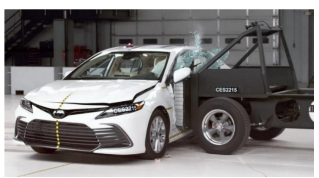
Figure 6. Side impact test [F6]