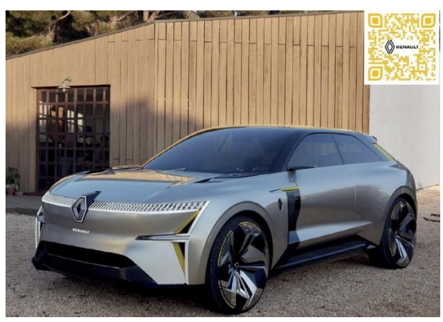
Figure 4. Renault Morphose [F4]