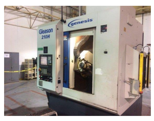
Figure 7. Gleason Genesis 210H (New Genesis series) [P7]

In 2006, the company introduced the 'New Genesis' family of milling and grinding machines. In 2011, in cooperation with Heller, 5-axis gear machining centres were established to produce large gears. In 2014, their 'New Phoenix 280G' machining machine will be released, which will significantly improve the tooth grinding performance of the bevel gear.