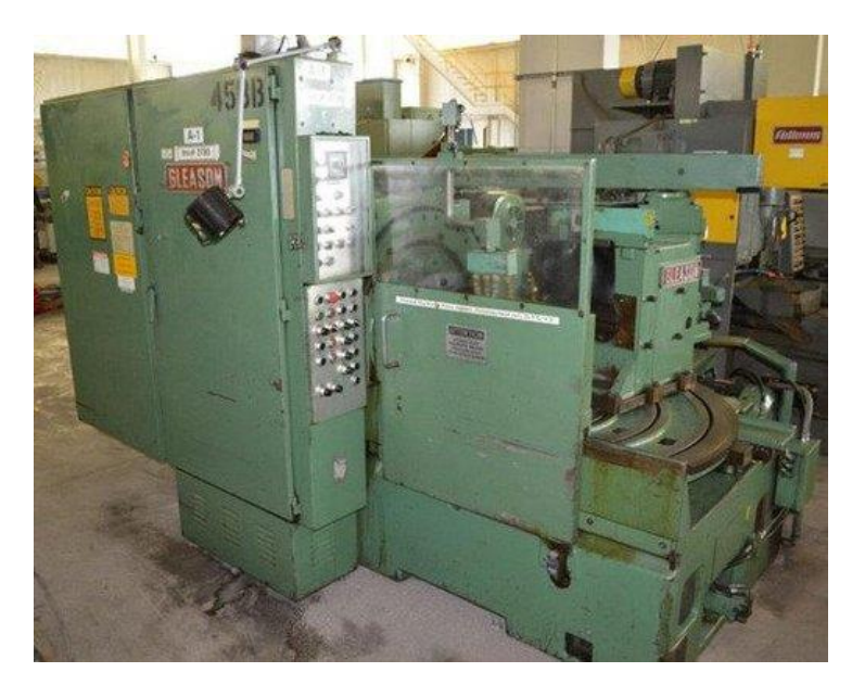
Figure 5. Gleason No. 641 Generator (PLC controlled) [P5]

In 1986, the company presented its first CNC-controlled bevel gear production equipment. In 1988, a production machine called Phoenix was created. It was the first 6-axis CNC-controlled milling machine suitable for the manufacture of spiral bevel gears [7], [8].