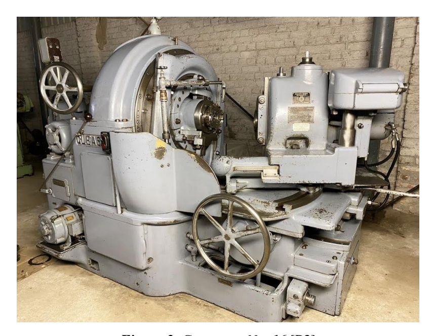
Figure 3. Generator No. 16 [P3]