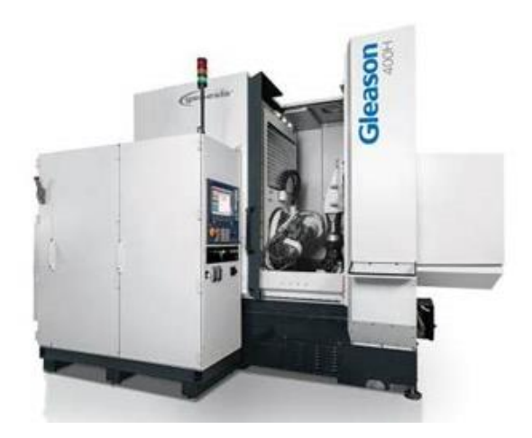
Figure 9. Gleason 400HCD [P9]

In 2018, Gleason began integrating KiSSsys design and FEM software with GEMS design and manufacturing software. This allows immediate action and communication between the design and manufacturing sides.