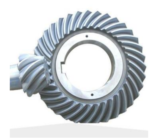
Figure 1. Gleason spiral bevel-gear pair [P1]

In the gear manufacturing industry, three large companies played a decisive role in the development of bevel gears. The three major companies, Gleason, Klingelnberg and Oerlikon laid the foundations for the production and theoretical background of modern bevel gears. Today, a significant portion of the bevel gears are manufactured using Gleason technology.