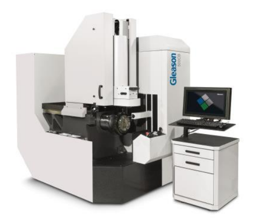
Figure 8. Gleason 500CB [P8]

In 2016, the 500CB analyser, and manufacturing equipment has been completed. The equipment is suitable for the manufacture and inspection of the machining heads.[5] [6]