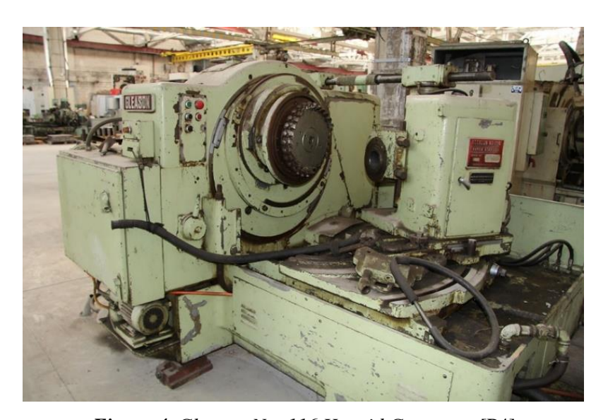
Figure 4. Gleason No. 116 Hypoid Generator [P4]

In 1977, Gleason introduced its PLC-controlled production equipment called the Gleason No. 641 Generator, which was able to create gears in a single workflow.