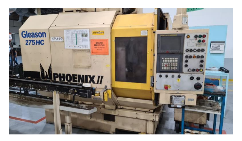
Figure 6. Phoenix II second gen. 6 axis Gleason bevel gear cutter [P6]

In 2000, the Phoenix II was introduced, which was already directly driven by a spindle drive it had higher productivity and faster grinding.